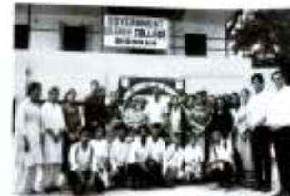
College organised plantation drive on 31.08.2019