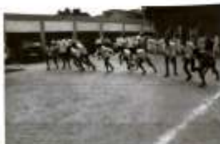
College Anniversary of Gurus Nank Dev ji