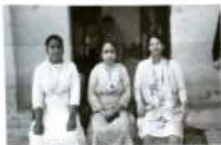
Students of B.A Sem-I of GDC Bishnah won gold Medal organizes athletic meet on 1.11.2019 on 550' Sixth order super Heavy weight in Jamia University from 30.11.2018 to 6.11.2019