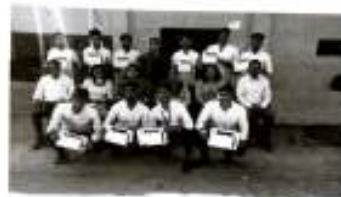
College organised an inter-collegiate seminar on Life and Fun 11th Oct-2019 to 19th Oct 2019