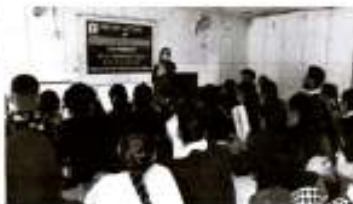
International Mother Language Day celebrated on 29.02.2020