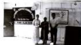
NSS unit of GDC Bishnah organised Poshan Abhiyan on 28.09.2019