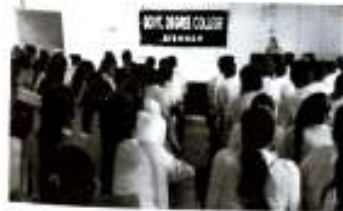
College organised a function on 03.08.2019 to inaugurate Newly constituted curricular and co-curricular clubs.