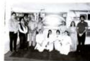
College participated in 5 days youth festival Bangen-19