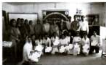
College organizes an inter collegiate quiz competition on 5.11.2019 on Life and preachings of Gurus nanak Dev ji