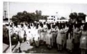
National Unity day observed on 31st Oct 2019 in GDC Bishnah