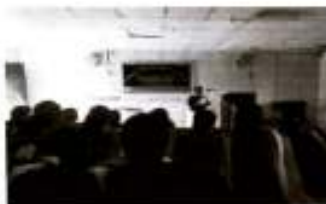
Symposium organised by College NSS Unit on National Constitution day on 26.11.2019