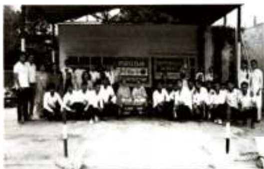
bronze in relay race in 2019-20

The College has a department of sports and games to promote among the students the qualities of sportsmanship and to tap the nascent talent lying among the students of the area. The Department has good lot of sports material for meeting the true requirements of various sports activities in which students are continuously encouraged to participate including inter-collegiate as well national tournaments/competitions from time to time. Special emphasis is given to overall development personality through various practice sessions held in the college before participating in actual event. The college has produced many sports persons who brought laurels by winning various sports competitions. College